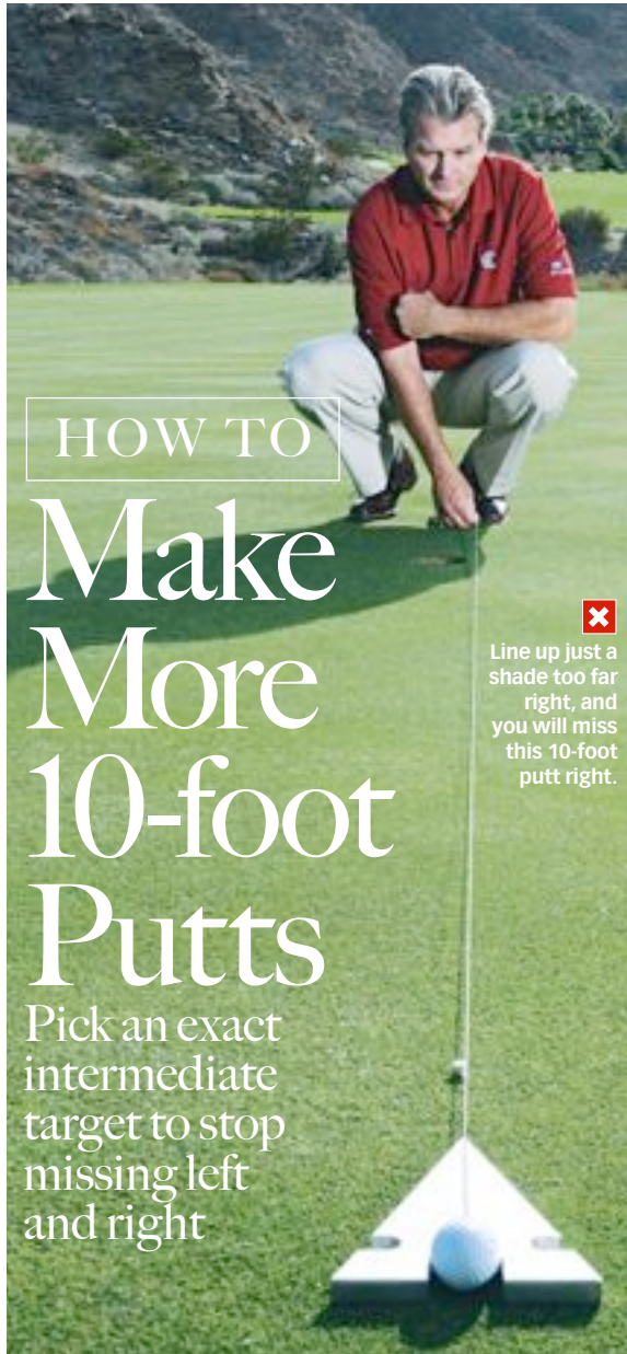
X Line up just a shade too far right, and you will miss this 10-foot putt right.

Pick an exact intermediate target to stop missing left and right